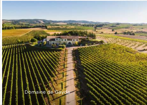
Domaine de Gayda