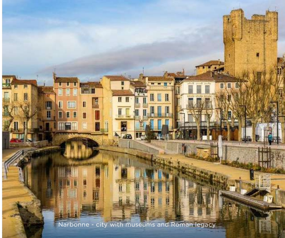
Narbonne - city with museums and Roman legacy