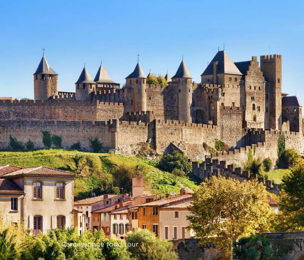
Carcassonne food tour