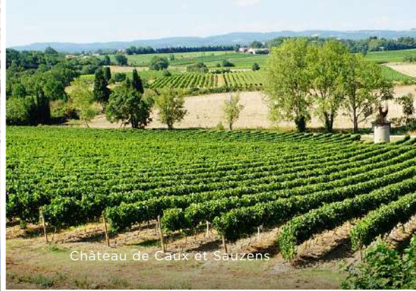
Château de Caux et Sauzens