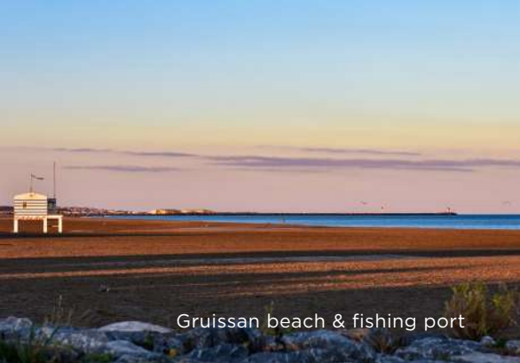
Gruissan beach & fishing port