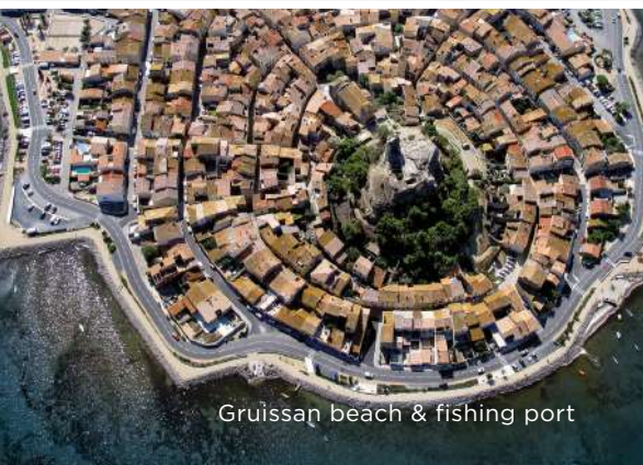
Gruissan beach & fishing port