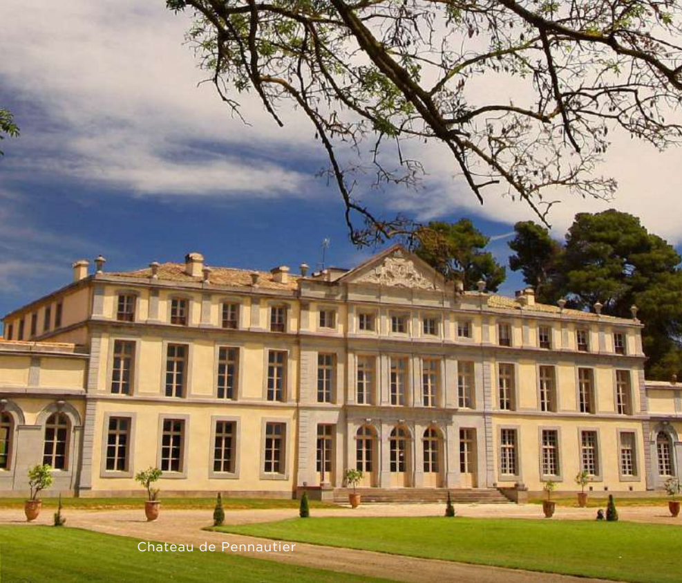
Chateau de Pennautier