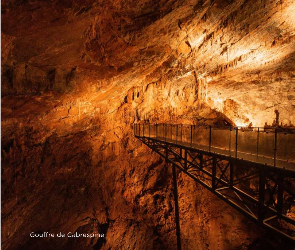
Gouffre de Cabrespine