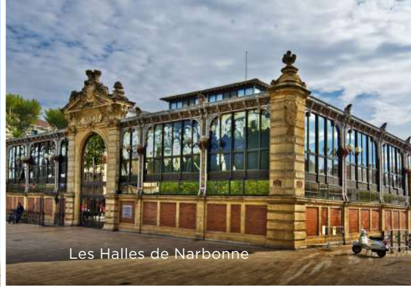
Les Halles de Narbonne