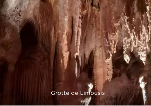
Grotte de Limousis